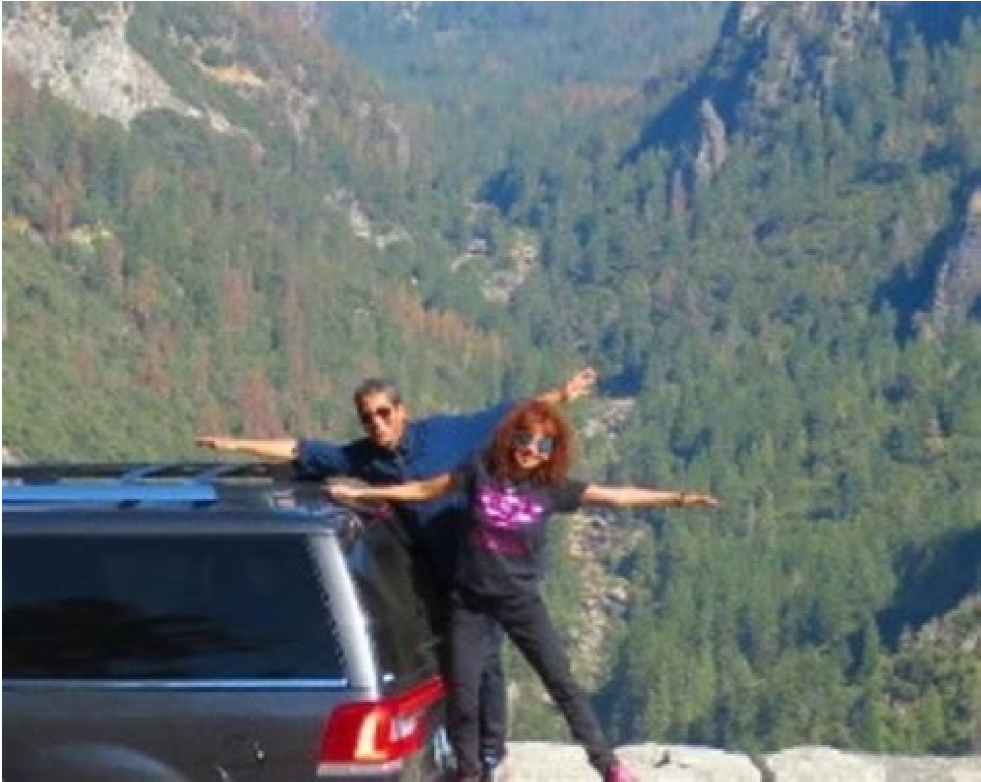
Self guided driving tour yosemite. Self guided tour yosemite national park.